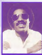
Stevie Wonder Producer, Recording Artist, Singer Los Angeles