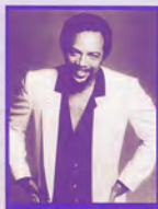
Quincy Jones Producer, Arranger Los Angeles

Use this no-nonsense approach to developing workable vocal technique, and begin Singing for the Stars .