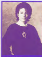
Michael Jackson Producer, Recording Artist, Singer Los Angeles