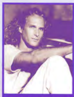
Michael Bolton Singer, Composer New York