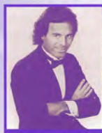
Julio Iglesias Singer Madrid

strain and no pain, honey.) We're "moving" with a new vocal, mental and physical health. Thank you for all those warm-ups for my Unforgettable, Take a Look, and Holly and the Ivy albums.