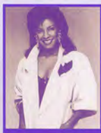
Natalie Cole Singer Los Angeles